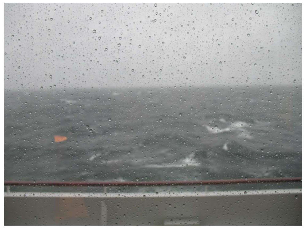
Saint Lawrence River Cruise 2009. View from our cabin window where it rained for 4 days straight! The Lido deck was closed!!!! It's all about me today.