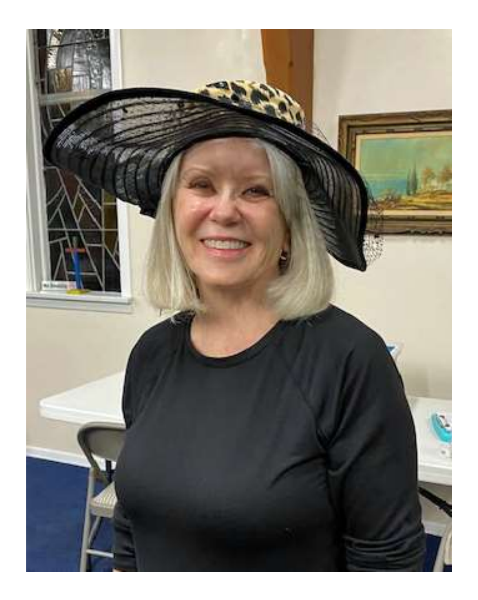
2023 - April Easter Hat Parade