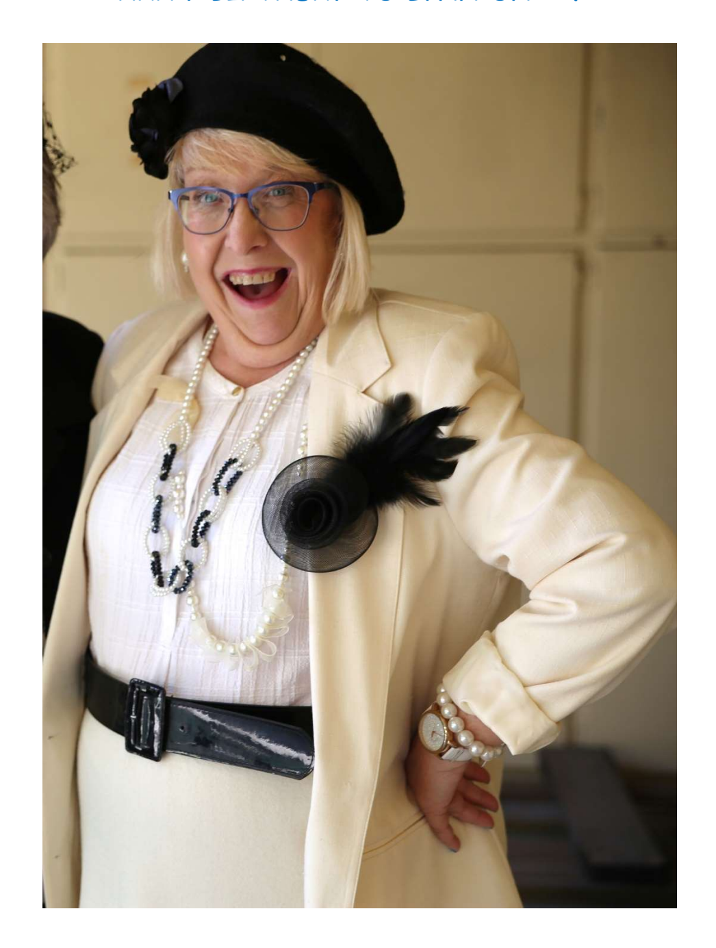
2023 - May performance at Leah's Church