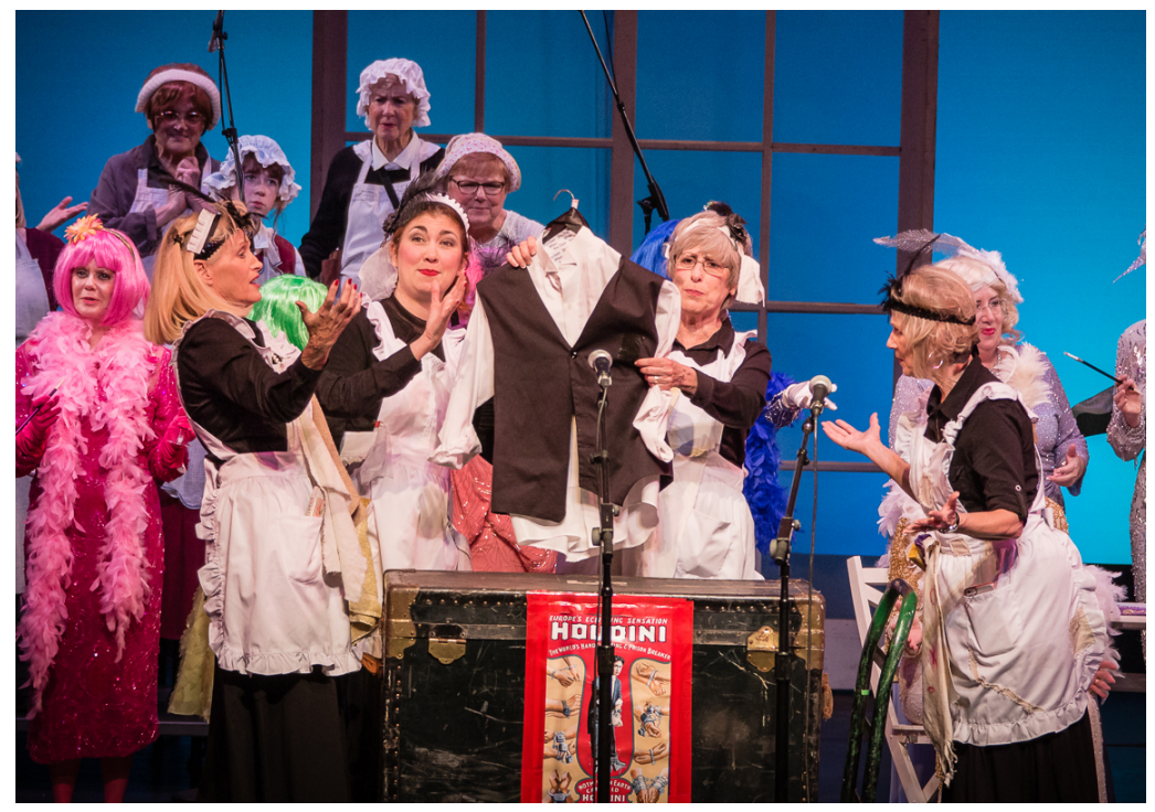
2014 – Monday Night Live in "Downton Shabby" singing "Old Black Magic" while rummaging thru Houdini's trunk!